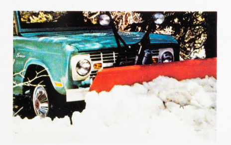
Snowplow Blade may be adjusted to various heights and angles (with kit) from inside the cab.