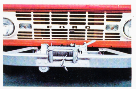
Front-Mounted Winch with 150 feet of 5/16-inch cable is power take-off driven.