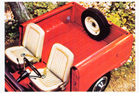
Front bucket seats. For extra comfort and sports flair, you can select pleated-vinyl bucket seats. Bucket seat option also includes outboard seat-belt retractors.

Sport Bronco Wagon and Pickup features, in addition to or in place of standard features, include: Bright-metal "Sport Bronco" emblem • Pleated parchment vinyl front seat • Vinyl door trim panels with bright-metal moldings • Hardboard headlining with bright-metal retainer moldings (Wagon models) • Parchment vinyl simulated-carpet front floor mat with bright-metal retainers • Rear floor mat is included