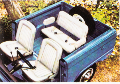
Bucket seats plus rear seat. With front buckets you can also have a matching pleatedvinyl, two-passenger rear seat with integral arm rests on Bronco Wagons.

with optional rear seat • Cigarette lighter • Satin-finish horn ring • Bright-metal drip rail moldings • Bright-metal windshield and window frames • Bright-metal grille molding, headlight and taillight bezels, tailgate release handle