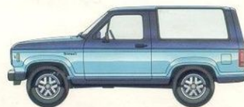
■ Body Color ■ Accent Color

Give your Bronco II XLT or XL series the distinctive style of Deluxe Two-Tone paint. The accent color is applied to mid-bodyside/liftgate below the chamfer and above the rocker area. A 2-color tape stripe at the two-tone break is included.