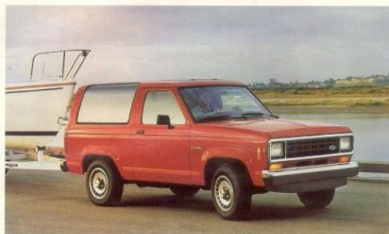
Bronco II is a great vehicle for recreational boat or trailer towing.