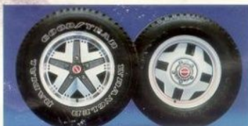
Cast aluminum wheels; White sport wheels