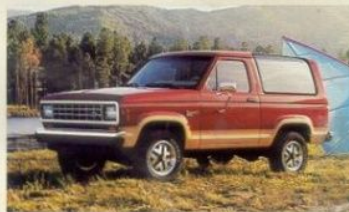
Eddie Bauer Bronco II is top of the line. Among its many features are air conditioning, special trim, plus the "Ford Care" extended maintenance and limited warranty program.