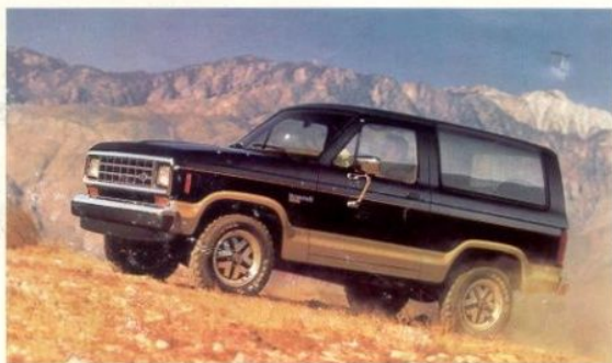
Four-wheeling enjoyment is yours in a V6-powered, fun-tough Bronco II 4x4.

Touch-Drive has other great features as well. Two special electrical interlocks prevent possible powertrain damage that might otherwise be