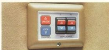
Power windows and door locks