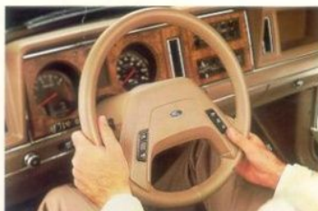
Speed control and tilt steering wheel

Among the features of this electronic stereo system are lighted liquid crystal display and illuminated controls, fully electronic manual or seek tuning, memory for 18 station settings (6 AM and 12 FM), and separate bass and treble controls. The cassette tape player features auto-reverse and Dolby® noise reduction. Also included are balance and fader controls for the front and rear speakers. All Bronco II sound systems for 1987 feature a digital clock.