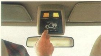
Optional Touch-Drive electric shift 4x4 transfer case

caused by a mis-shift between 4-high and 4-low. Shifting into or out of 4-low can only be done when the vehicle is either stopped or moving below 3 mph with the manual transmission clutch disengaged or the automatic transmission in neutral position. Also, the automatic locking hubs engage instantly because Touch-Drive utilizes an innovative magnetic clutch that spins up the front drive system from zero to driving speed in milliseconds.