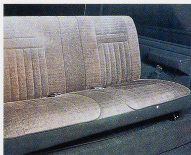
▲ Standard 3-passenger flip/fold rear bench seat in Dark Charcoal.

shield molding Swing-down tailgate with power window Sport wheel covers.