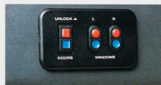
◀ Power door locks/windows are standard with Eddie Bauer.