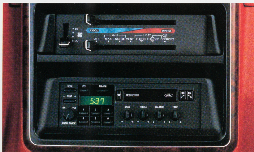
▲ Shown above, speed control/tilt steering wheel is standard in XLT and Eddie Bauer, optional in Custom Bronco. The wheel tilts to five positions and makes for easy entry and exit.