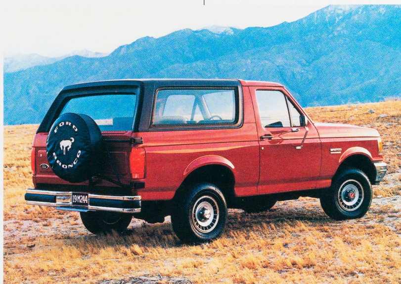
▼ Bronco Custom in Scarlet Red with Raven Black fiberglass roof.