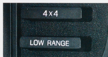
◀ Touch Drive allows you to shift from 2-wheel drive to four-wheel drive High and back again "on the fly."